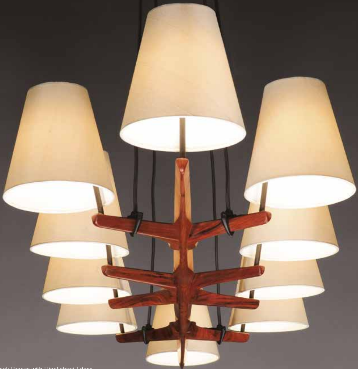
Rosewood | Black Bronze with Highlighted Edges