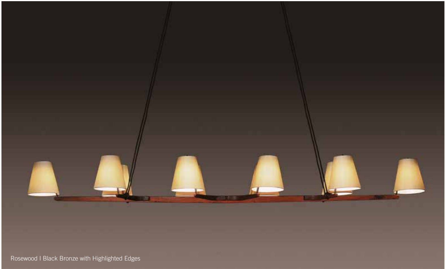
Rosewood | Black Bronze with Highlighted Edges