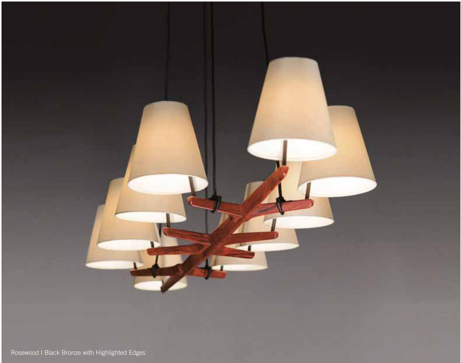
Rosewood | Black Bronze with Highlighted Edges