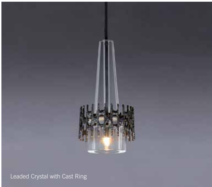
Leaded Crystal with Cast Ring