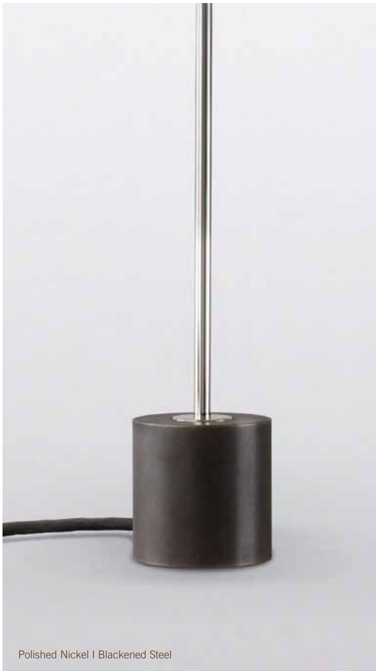
Polished Nickel | Blackened Steel