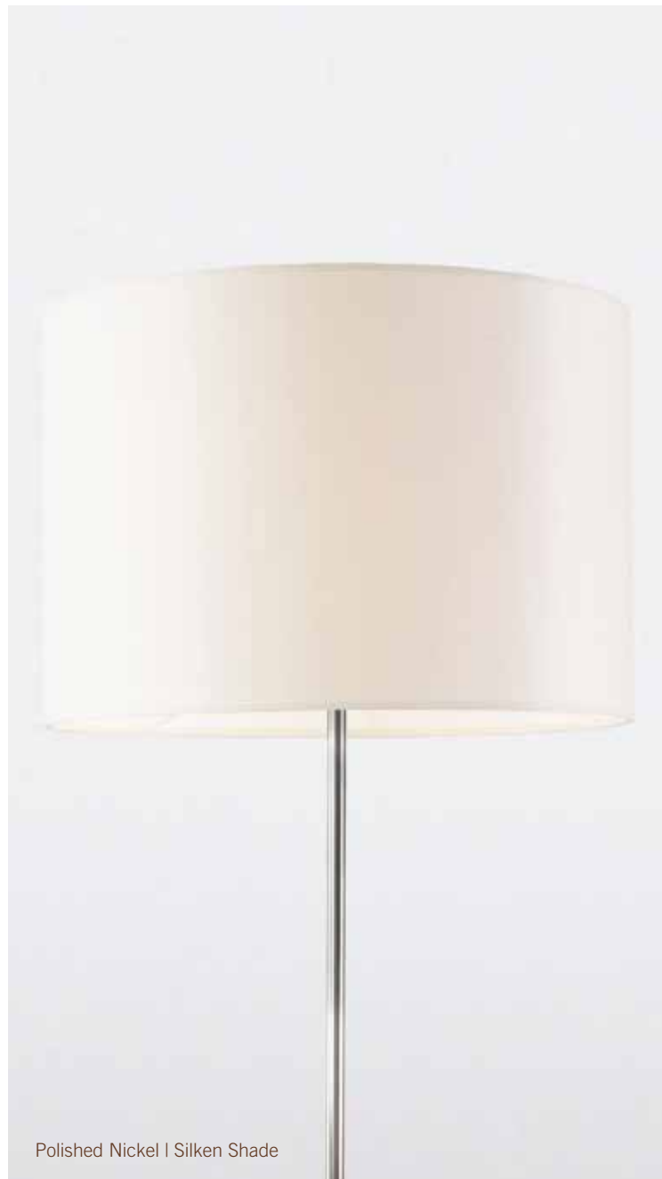
Polished Nickel | Silken Shade