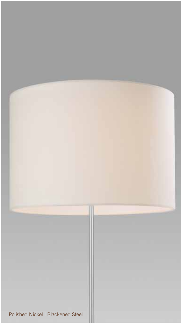
Polished Nickel | Blackened Steel