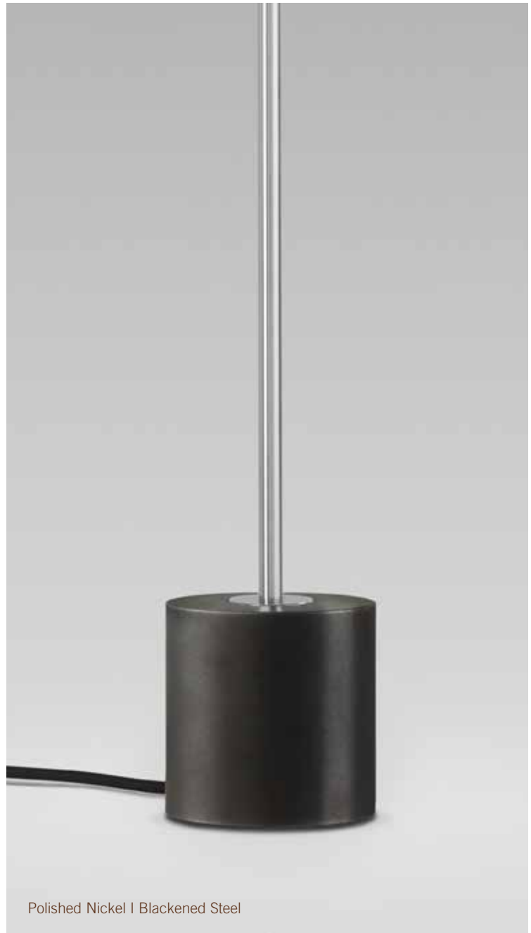
Polished Nickel | Blackened Steel