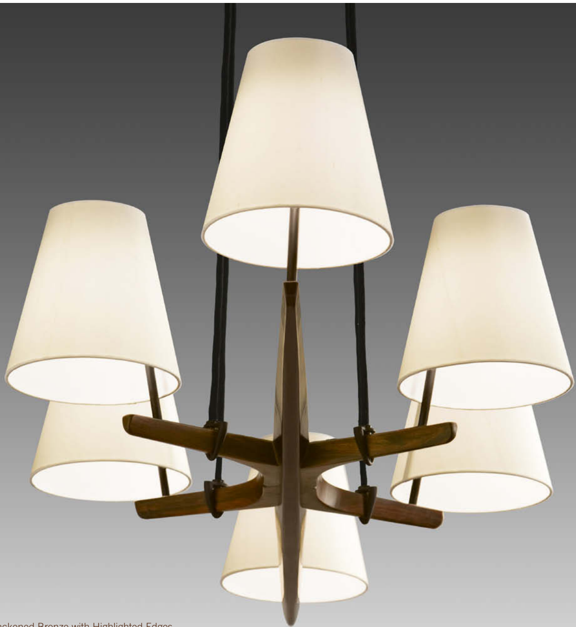
Rosewood | Blackened Bronze with Highlighted Edges