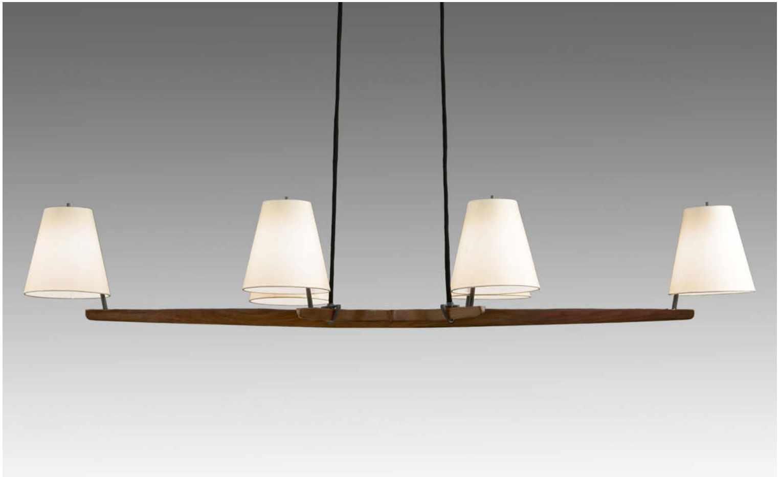
Rosewood | Blackened Bronze with Highlighted Edges