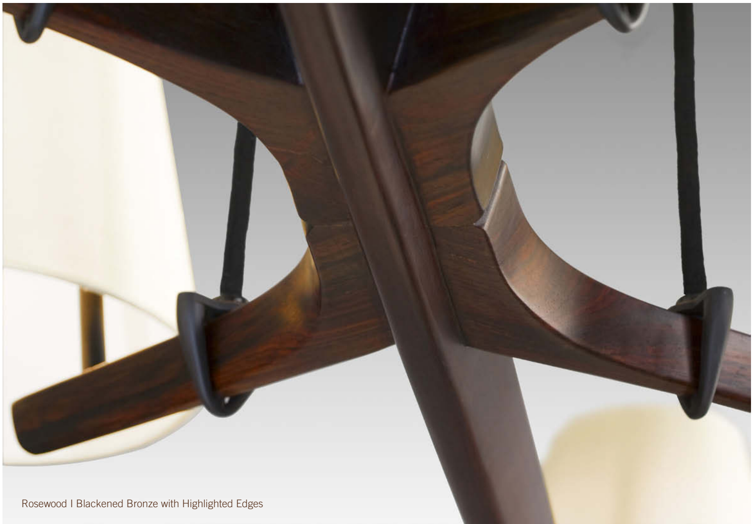
Rosewood | Blackened Bronze with Highlighted Edges