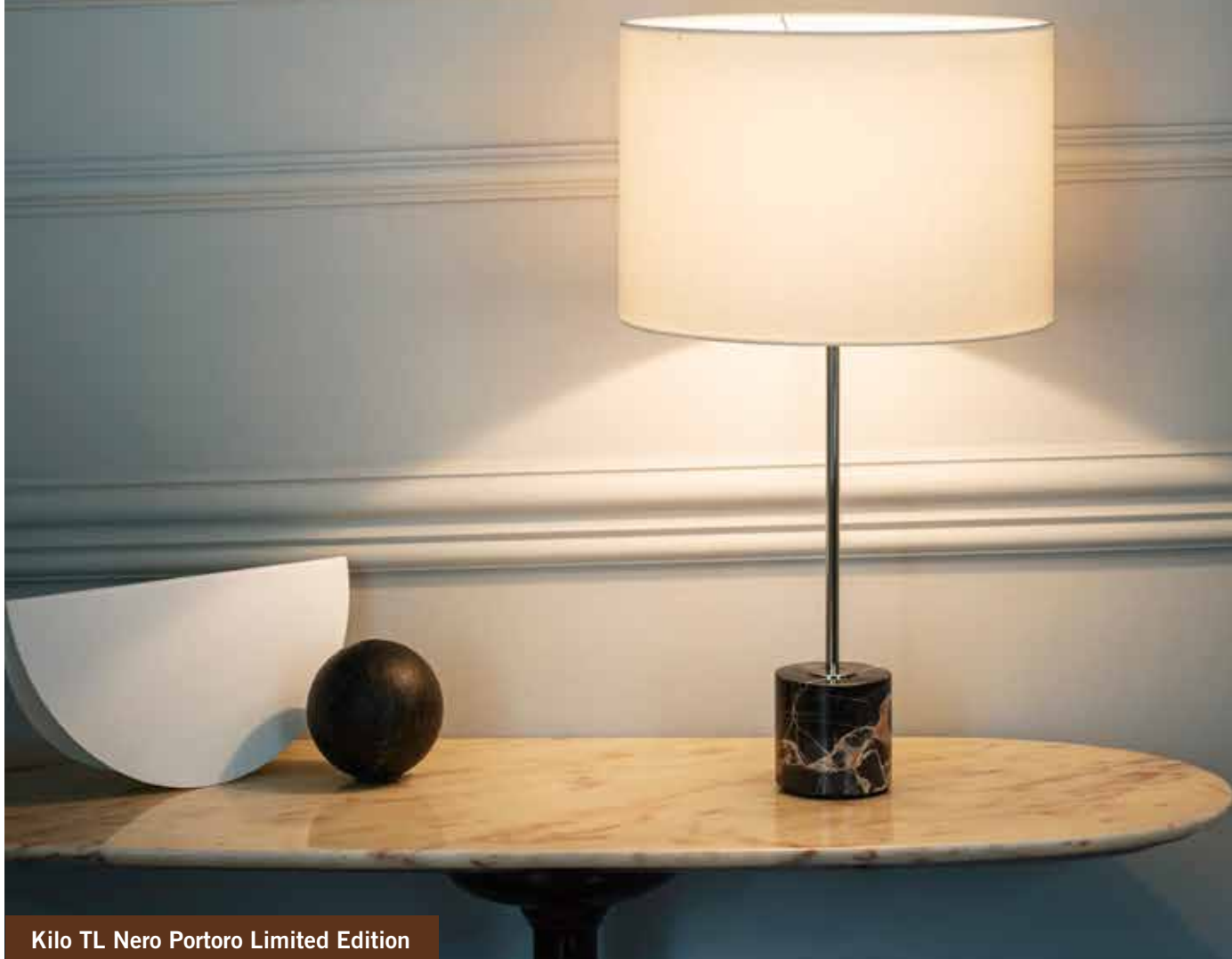
Kilo TL Nero Portoro Limited Edition